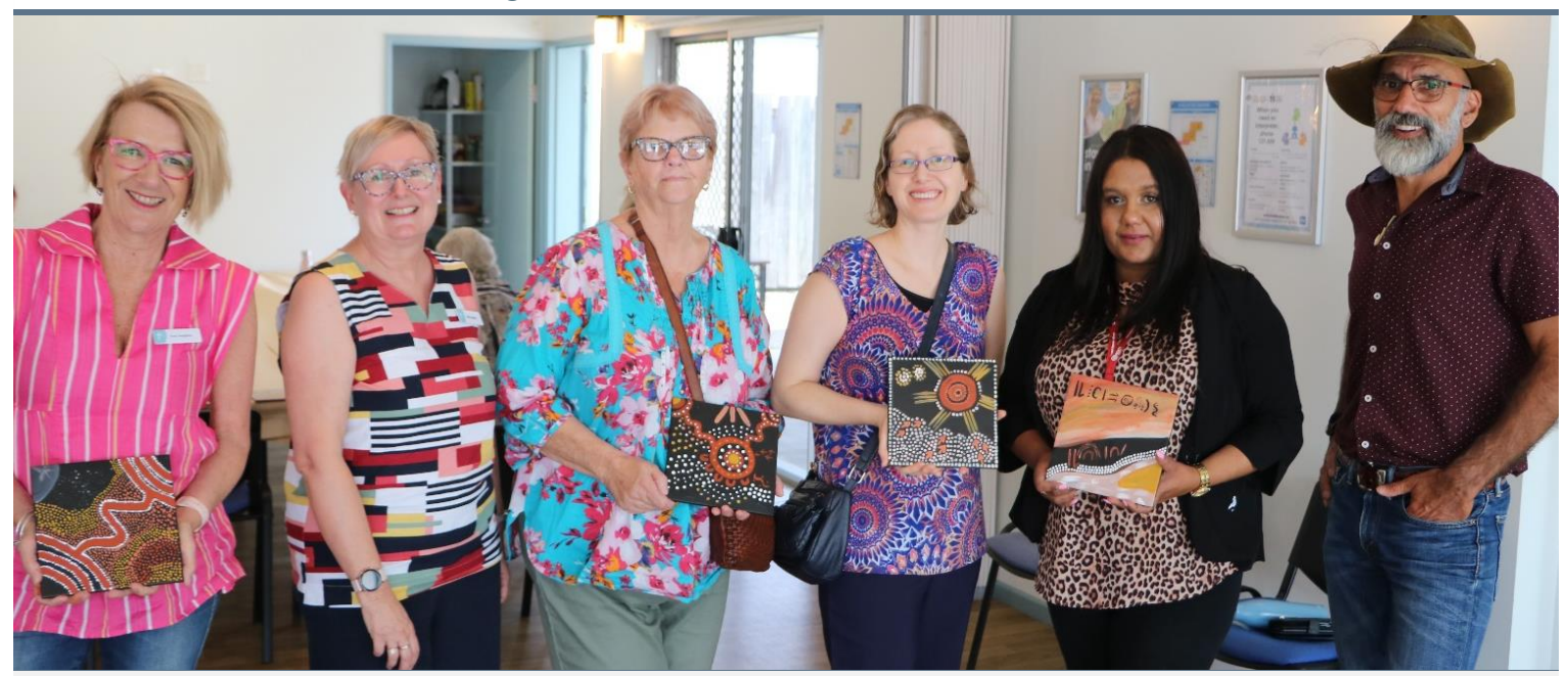
INCREDIBLE ARTWORKS MADE AT THE IPSWICH ART WORKSHOP IN DECEMBER